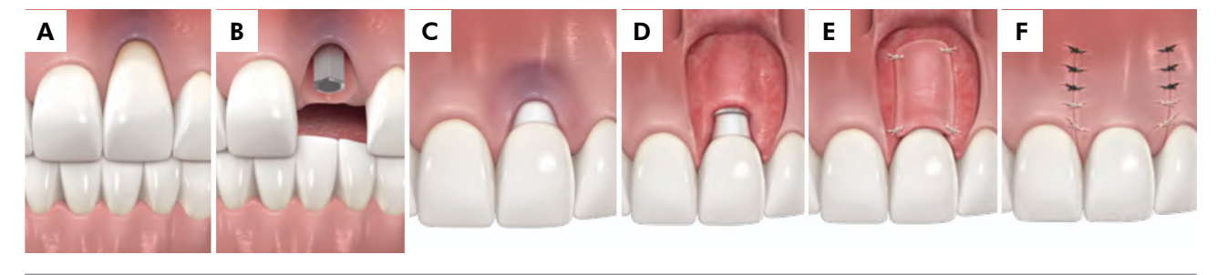
Figure 2. An implant that had a thin biotype and peri-implant recession (a) was treated by using a combination of prosthetic and surgical procedures. The implant crown and metal abutment (b) were removed, and an impression of the implant was performed to create a new zirconia abutment with a concave contour, in which the finishing line was placed at the level of the soft tissue margin of the contralateral tooth (c). Two vertical incisions were performed to create a full/split thickness flap (d). A thick connective tissue was sutured at the level of the abutment finishing line (e), and the flap was positioned coronally (f).

An implant with an adequate diameter that is placed in a favorable tridimensional position within the bony envelope with limited or without interproximal tissue loss is a good candidate to receive soft tissue grafting for the treatment of PIR. Although there are few prospective studies that address this type of defect, partial to full coverage may be expected depending on the extent of the clinical alteration and overall prognosis.<sup>2,12,38,39</sup> Shibli et al.<sup>40</sup> proposed one of the first published methods to treat PIR in 2004 and reported that recession was successfully treated by using a combination of prosthetic and surgical procedures. The abutment diameter and provisional were initially reduced in its facial aspect followed by a coronally advanced flap (CAF) that was associated with a thick CTG graft (Figure 2).