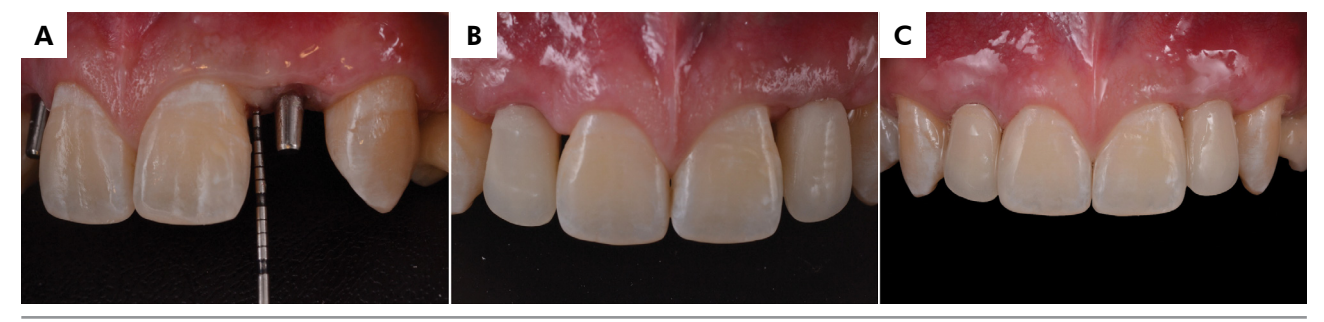
Figure 6. The distance between the bone crest and the tip of the papillae was 3 mm in height (a). The anatomy of the implants provisional restorations (b) and the distal aspect of the maxillary central incisors (c) were modified, and the contact point was shifted apically.

experience better outcomes than sites with partial or complete loss of papilla.