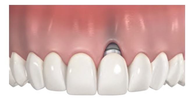
Figure 1. Clinical alterations in an implant placed in the anterior region.

Treatment of soft tissue defects around implants is challenging, especially in the esthetic region (Figure 1). To quantify soft tissue esthetic parameters, the Pink Esthetic Score<sup>14</sup> was developed to evaluate mesial and distal papilla, soft tissue margin and contour